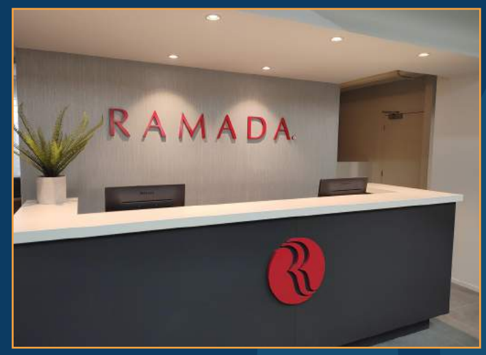
Hotel training area