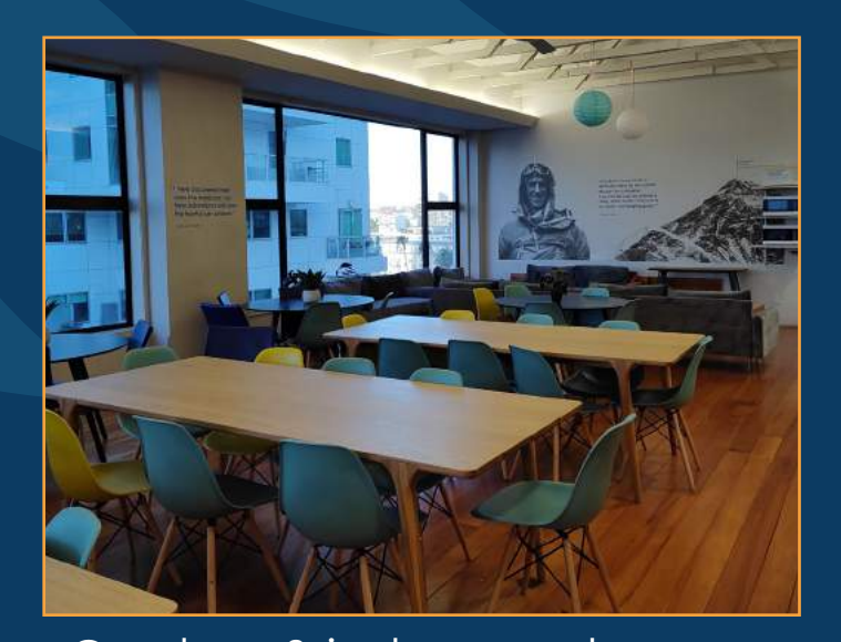
Outdoor & indoor student common area