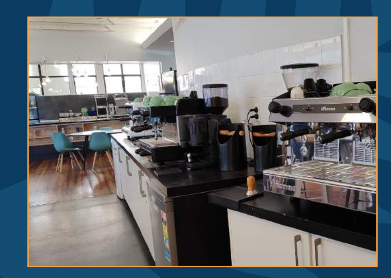
· Barista training area