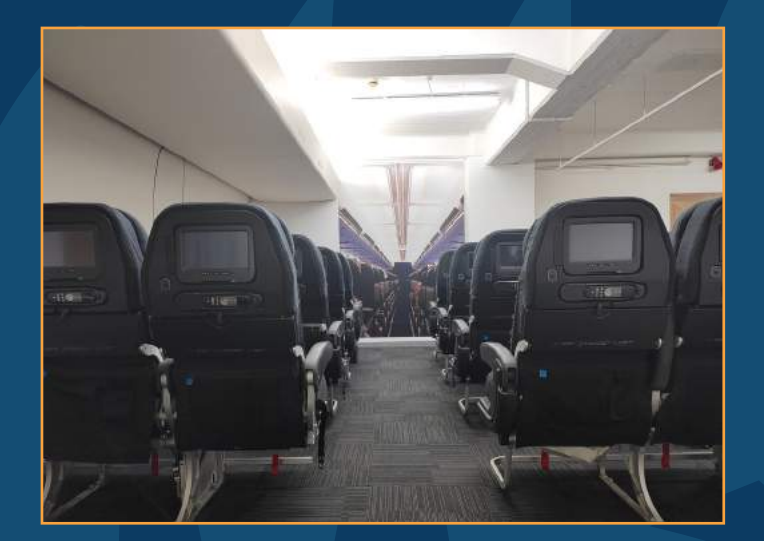
· Aircraft cabin training area