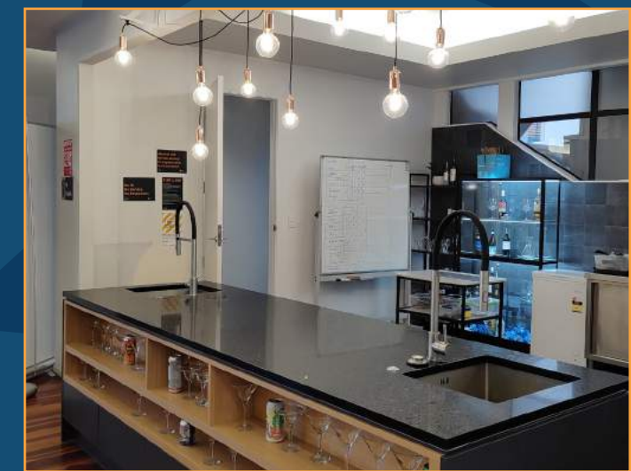
Bar training area